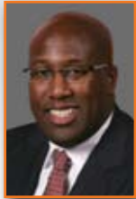
MIKE BROWN Cleveland Cavaliers