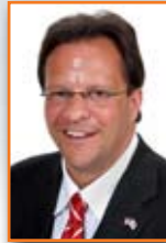
TOM CREAN Indiana University

FOR MORE INFORMATION & TO REGISTER: WWW.DOUBLEPUMP.COM OR 818.709.7696