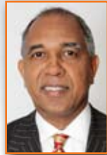
TUBBY SMITH University of Minnesota