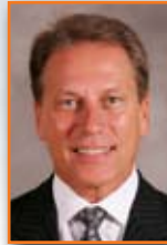
TOM IZZO Michigan State University