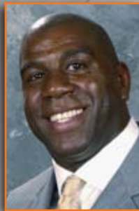
Earvin "Magic" Johnson

One of the 50 Greatest Players in NBA History. Vice President of the Los Angeles Lakers. NBA Hall of Famer.